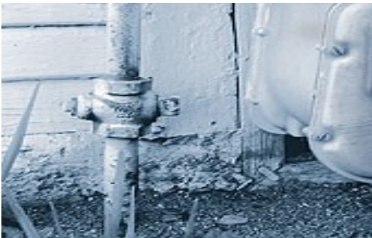
Gas On /Off valve