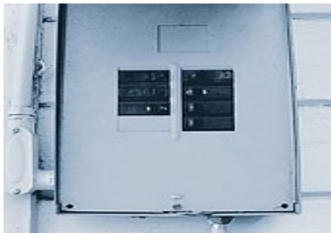
Electric Breaker Panel